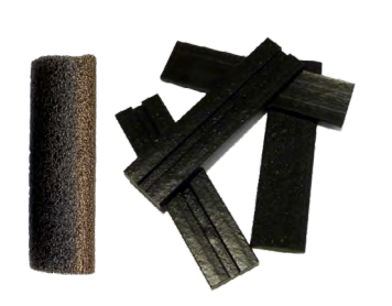
Backer Rods & Setting Blocks