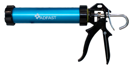
Adseal 400MG (400ml)